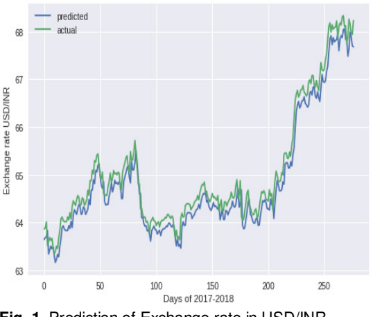
Prediction of exchange rate USD/INR with daily step

The graph showing the predicted to actual values of the currency exchange rate is shown below.